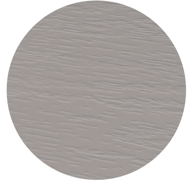
Satin finish wood-grain texture shown in Brownstone